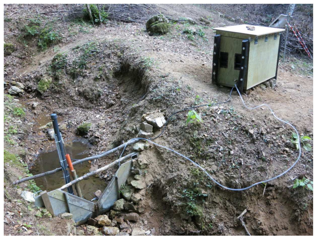
Figure 6. Streamgauge with the box containing the automatic water sampler.