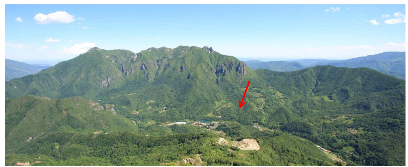
Figure 2. View of the Posina Valley looking at South-East. The red arrow indicates the position of the Ressi catchment.