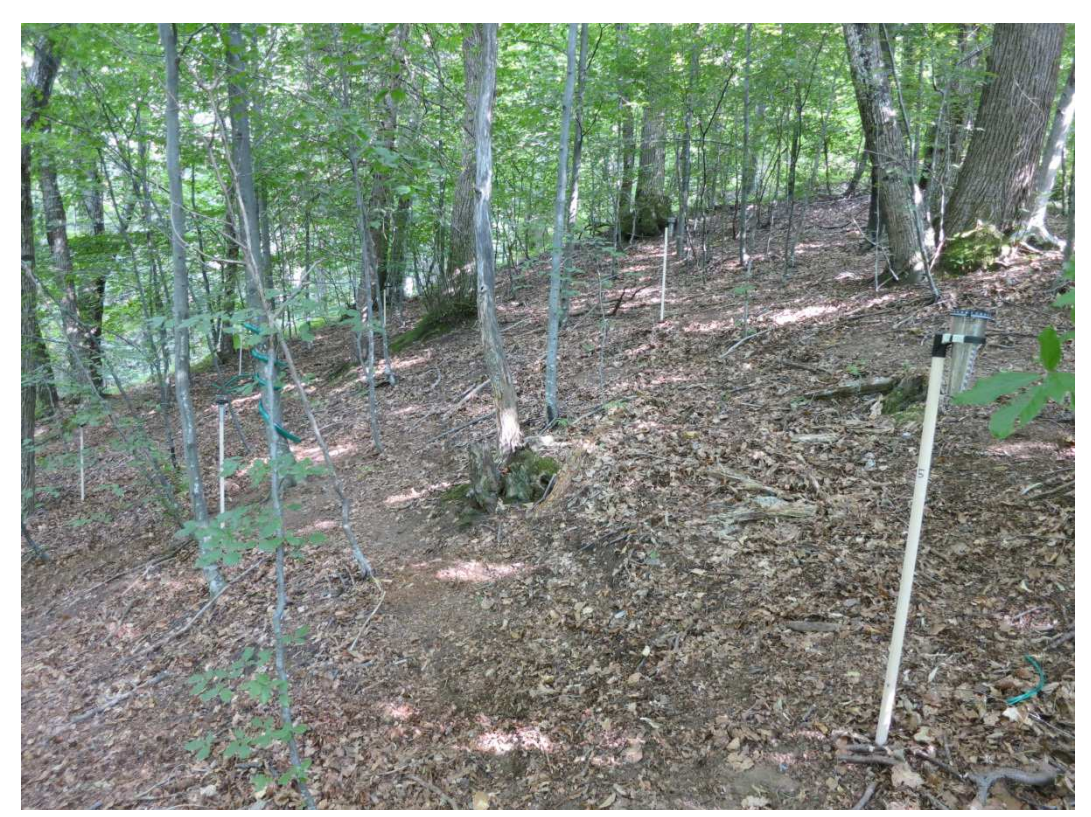
Figure 4. Plot with 12 rainfall totalizer for interception measurements.