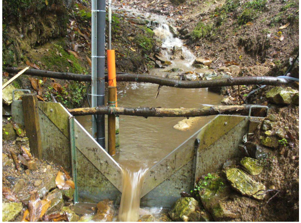
Figure 7. Streamgauge during a rainfall-runoff event.