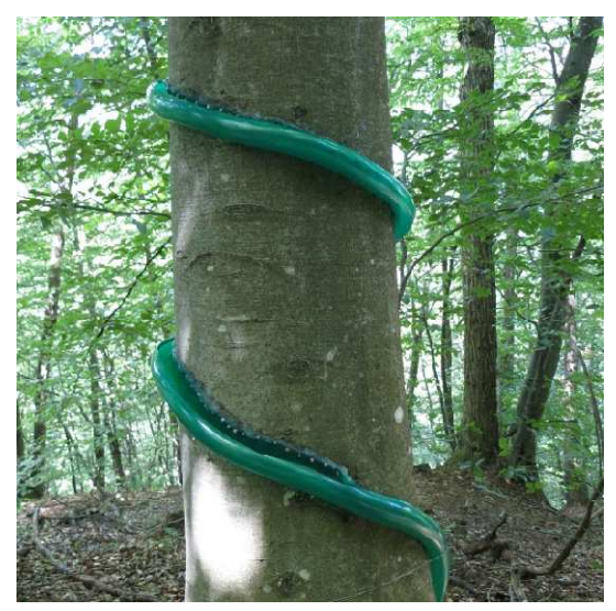
Figure 5. One of the six selected beeches for stemflow measurements.